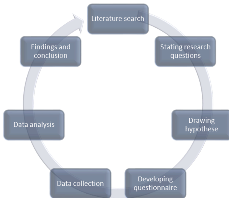
Figure 2 research pattern

The research was conducted on following pattern: